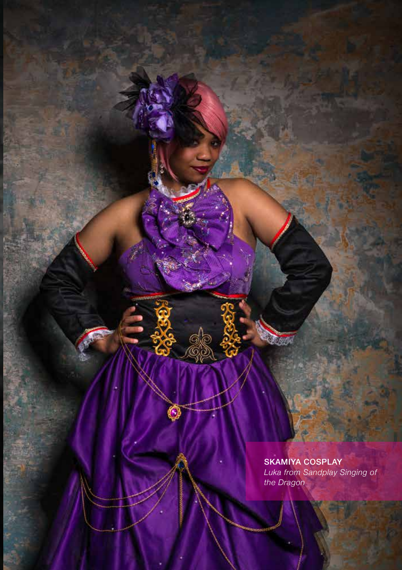
SKAMIYA COSPLAY Luka from Sandplay Singing of the Dragon