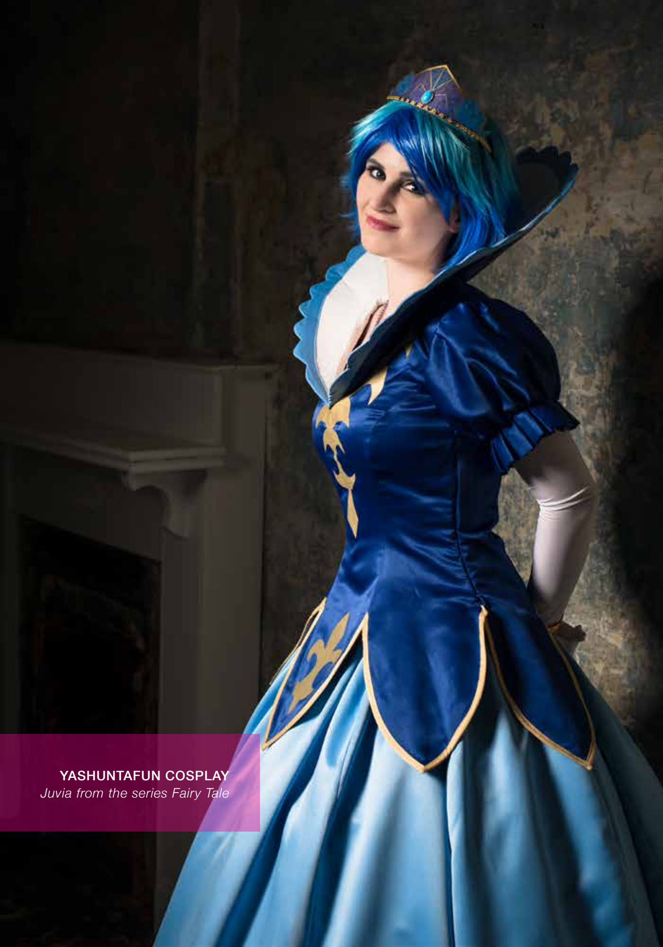
YASHUNTA FUN COSPLAY Juvia from the series Fairy Tale